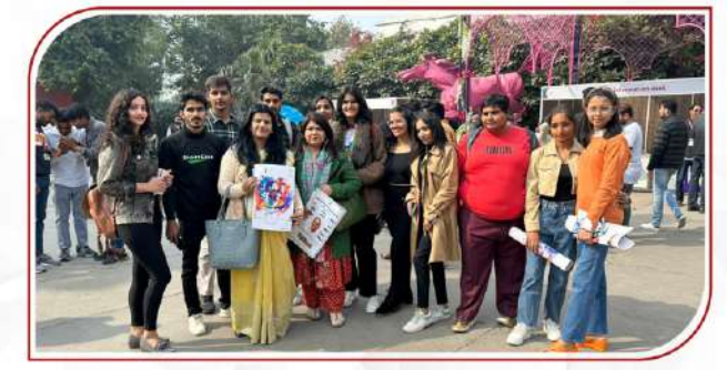
INDUSTRIAL VISIT OF STUDENTS TO CENTRAL SHEEP AND WOOL RESEARCH INSTITUTE, AVIKANAGAR